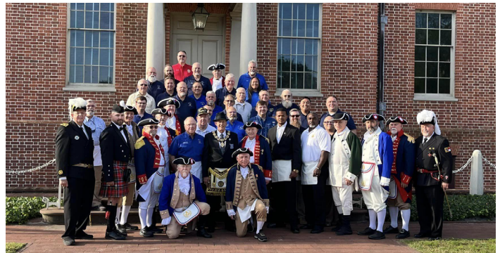
Brethren of the Scottish Rite, York Rite, National Sojourners, Blue Lodges who participated in the New Bern Resolves Procession assemble on the steps of Tryon Palace.

On 23-24 August, 2024, New Bern celebrated the 250th Anniversary of the New Bern Resolves, one of the precursors leading to the Declaration of Independence. The Valley of New Bern Scottish Rite, New Bern York Rite, National Sojourners Camp LeJeune Chapter #329 and North Carolina Chapter #97, St. Johns #3 and Zion #81 Lodges AF&AM co-sponsored and participated in this two day event in partnership with Tryon Palace, the New Bern History Center, New Bern Chapter Sons of the American Revolution and the Richard Dobbs Spaight Chapter Daughters of the American Revolution. Significant events during the two day celebration consisting of Patriot Grave Markings of 5 Revolutionary patriots at Christ Church Episcopal Cemetery, a procession to Tryon Palace, the colonial governors residence, an observance which rendered honors by several dignitaries,